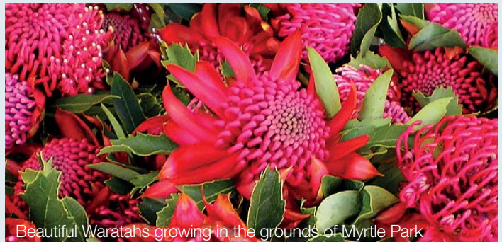
Beautiful Waratahs growing in the grounds of Myrtle Park